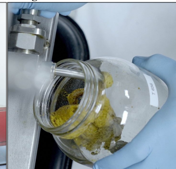
Figure 2: Cannabis Extract