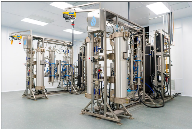
Figure 5: MediPharm Extraction Clean Room