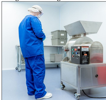
Figure 1: Milling Dried Flower

Company Description LABS focuses on cannabis oil extraction. The Company operates a cGMP facility and ISO-9000-rated laboratory clean rooms in Barrie, Ontario. Due to its differentiated-focused extracts-only business strategy, MediPharm acts as a strategic partner to any LP, providing both white-label production and contract processing. LABS is expanding globally and is currently developing an extraction facility in Australia, expected to be completed in 2H/2019.